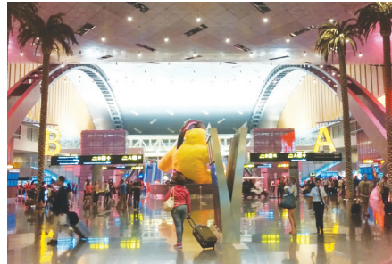
Hamad Airport, Qatar