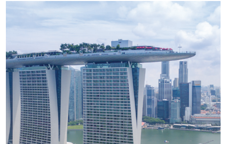
Marina Bay Sands Hotel, Singapore