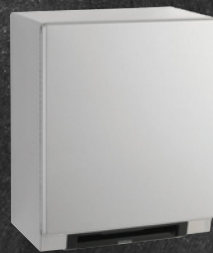
B-2974 Automatic, Universal Surface-Mounted Roll Towel Dispenser