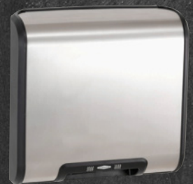
B-7128 QuietDry™ Series, TrimDry™ ADA Surface- Mounted Hand Dryer