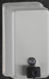
B-2111 ClassicSeries® Surface-Mounted Soap Dispenser