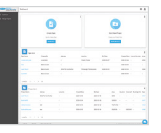
Digital Spec Builder Powered by ATS