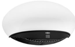
Architectural Design High-Traffic Eclipse™ Dryer