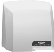
Economical Compac™ Dryer