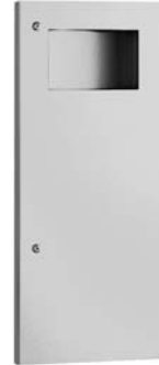
Architectural Design TrimLine™ Series