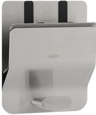
Patented, Patent Pending