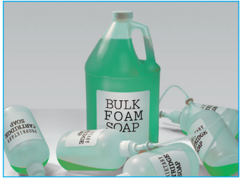
Bulk-fill is economical and ecological.