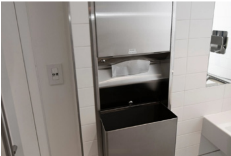
The B-3942 semi-recessed paper towel dispenser/waste receptacle features a sizeable 12-gallon receptacle for easy disposal of used paper towels.

The semi-recessed paper towel dispenser/waste receptacle unit features a folded paper towel module and a 12-gallon waste container for easy disposal of used paper towels. The innovative Klutch device holder features a patented pivoting cradle that safely keeps phones, tablets and laptops away from wet or unsanitary surfaces in restrooms, which was critical for Apple store customers.