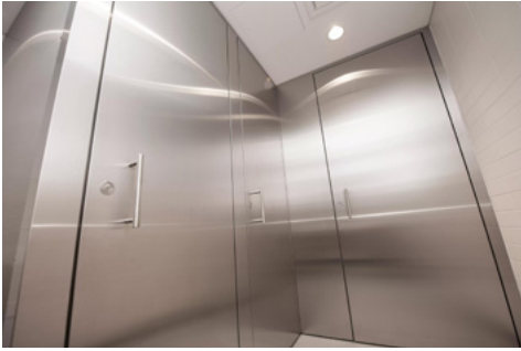
Flow stainless-steel cubicles at the Al Maryah Island, Abu Dhabi Apple store.

helping to create a clean and hygienic environment. Designed with robust engineering principles and made from premium stainless steel, these accessories provide unmatched quality and durability, ensuring they stand the test of time.