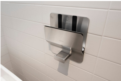
The B-635 Klutch stainless steel mobile device holder has won multiple innovation awards.

The Apple Store on Al Maryah Island skillfully incorporates modern, sleek, stainless-steel features such as cubicles, paper towel dispensers, mobile device holders and baby changing stations. These accessories enhance the restroom's aesthetic appeal, creating a unique and friendly experience that aligns with and reflects Apple's brand philosophy.