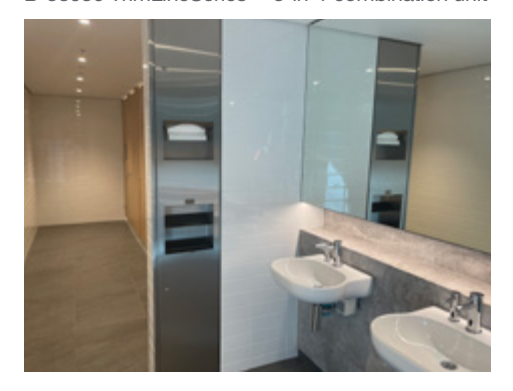
The B-322037, a modification of B-38033 TrimLineSeries™ Recessed Paper Towel Dispenser, Automatic Hand Dryer and Waste Bin, retained the sleek, streamlined aesthetic of the original.