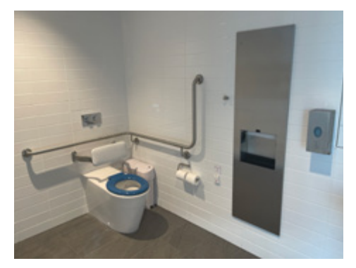
B-38030 TrimLineSeries™ 3-in-1 combination unit