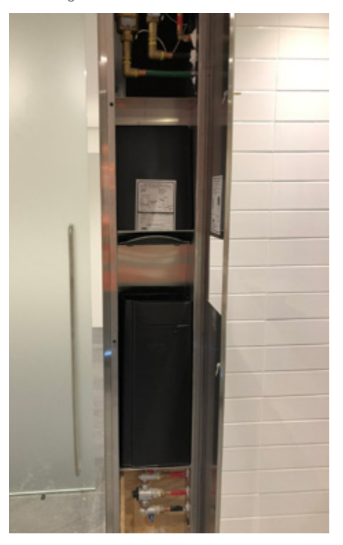
Bobrick's B-38033 TrimLineSeries™ Recessed Paper Towel Dispenser, Automatic Hand Dryer and Waste Bin was customised for use in 6&8 Parramatta Square to fit a tight space that also had to accommodate plumbing.

Meanwhile, the customised cabinet models achieved all the project's unique goals and are meeting all of Paramatta Square's needs for design, maintenance, hygiene, and durability.