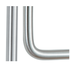
Continuity of diameter dimensions