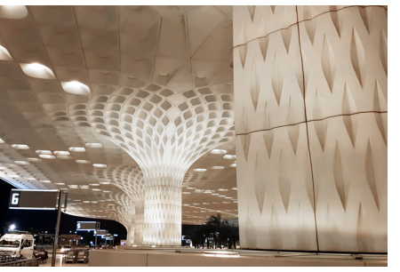
Mumbai International Airport, India