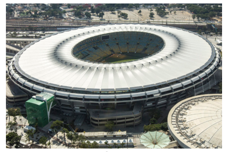
Maracana Stadium, Brazil