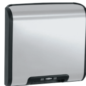
TrimDry available in satin stainless steel (B-7128) or white epoxy (B-7120) finish.

For more information, contact: international@bobrick.com or visit www.bobrick.co.uk .