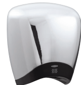
DuraDry™ available in chrome (B-778) or white epoxy (B-770) finish.