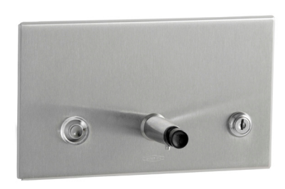
B-306 Recessed Soap Dispenser

Satin-finish stainless steel. Enclosed plastic soap vessel on back of door. Swings open for easy filling. Full-length hinge and key lock secure door to cabinet. Capacity: 45 fl-oz. See image on page 2.