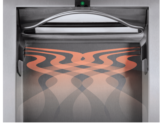
Detail of B-38030 Drying Zone